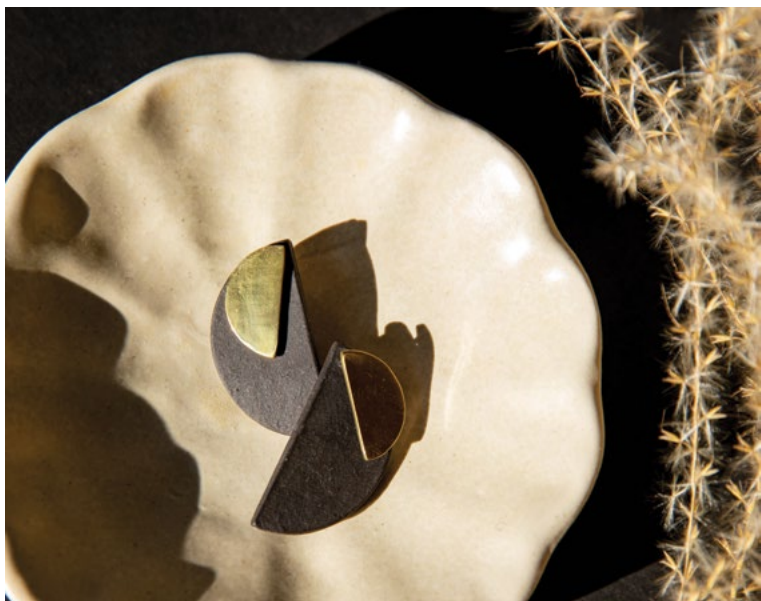
#CPX-CDE-BT Canyon Drop Earrings