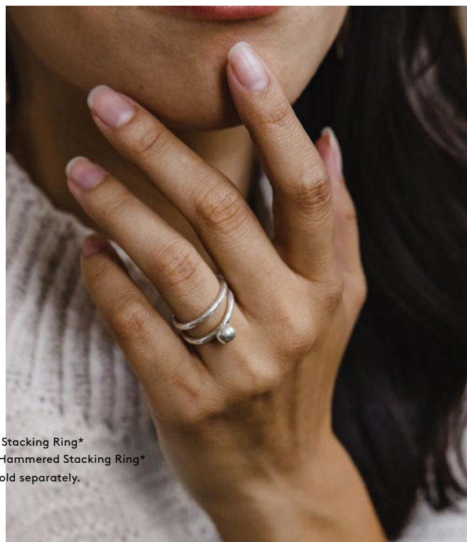
#SHDR-ST Droplet Stacking Ring* #SHR-ST Simple Hammered Stacking Ring* *Stacking Rings are sold separately.

THE RAIN COLLECTION – A NOD TO THE MONSOON IN THE HIMALAYAS – HOME TO THE ARTISTS WHO MAKE OUR COLLECTIONS.