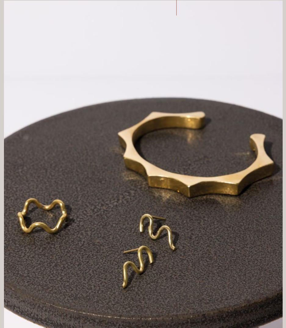
#CCB-B Crown Cuff Bangle #WSE-B Wavy Stud Earrings #WVR-B Wavy Band Ring

Shown in Sterling and Brass. Select styles also available in Oxidized Brass.