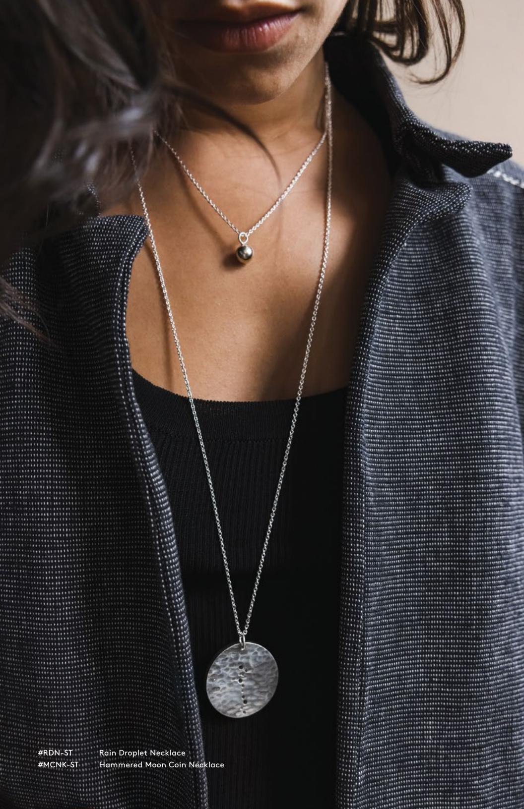
#RDN-ST Rain Droplet Necklace #MCNK-ST Hammered Moon Coin Necklace