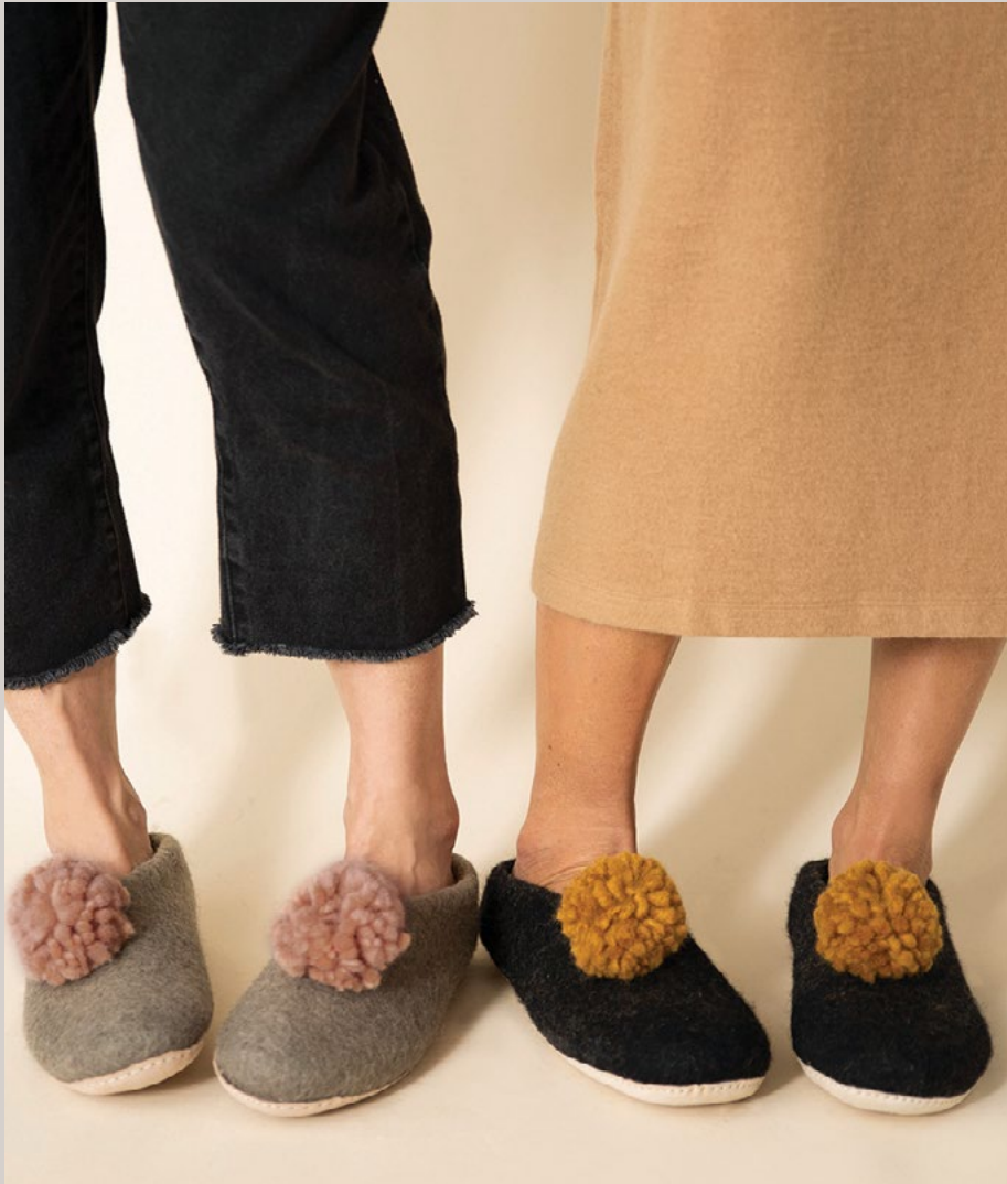
#PSGM Pom Pom Slippers - Light Grey/Muted Rose #PSDG Pom Pom Slippers - Dark Grey/Gold

POM POM SLIPPERS FOR EVERYONE. AVAILABLE IN 6 COLORS + 3 SIZES. HAPPY FEET ENSUE.