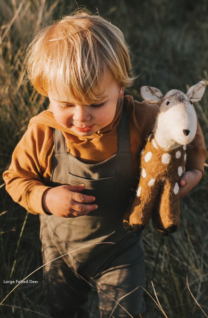
#FDRL Large Felted Deer

WITH EARNEST, CURIOUS FACES AND HAND-STITCHED WHISKERS AND PAWS – NO ONE CAN RESIST OUR WOOLIES, BIG OR SMALL.