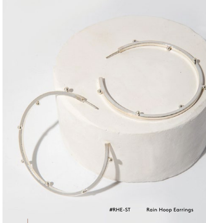
#RHE-ST Rain Hoop Earrings