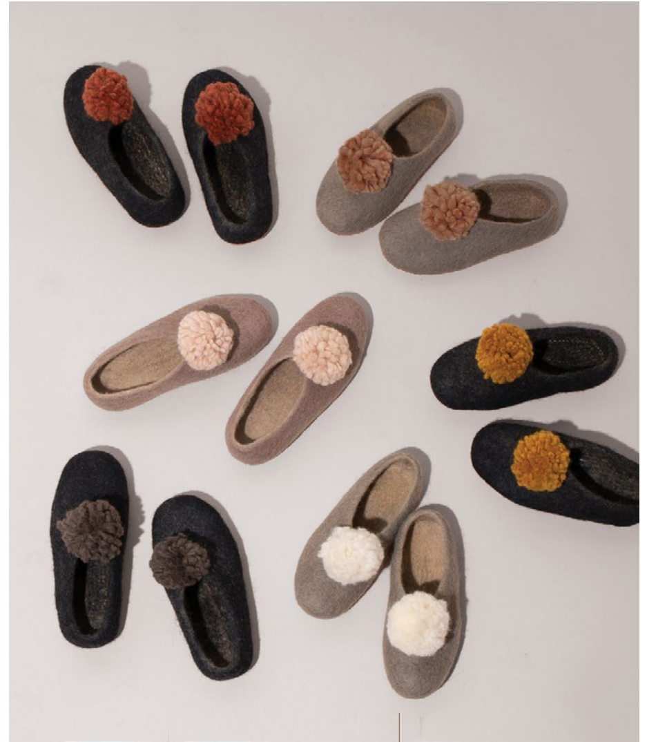
#PSDR Pom Pom Slippers - Dark Grey/Rust #PSGM Pom Pom Slippers - Light Grey/Muted Rose #PSCH Pom Pom Slippers - Champagne #PSDG Pom Pom Slippers - Dark Grey/Gold #PSDK Pom Pom Slippers - Dark Grey #PSGW Pom Pom Slippers - Light Grey/White