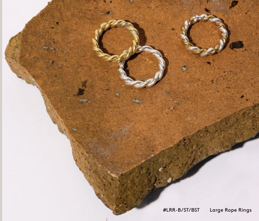
#LRR-B/ST/BST Large Rope Rings