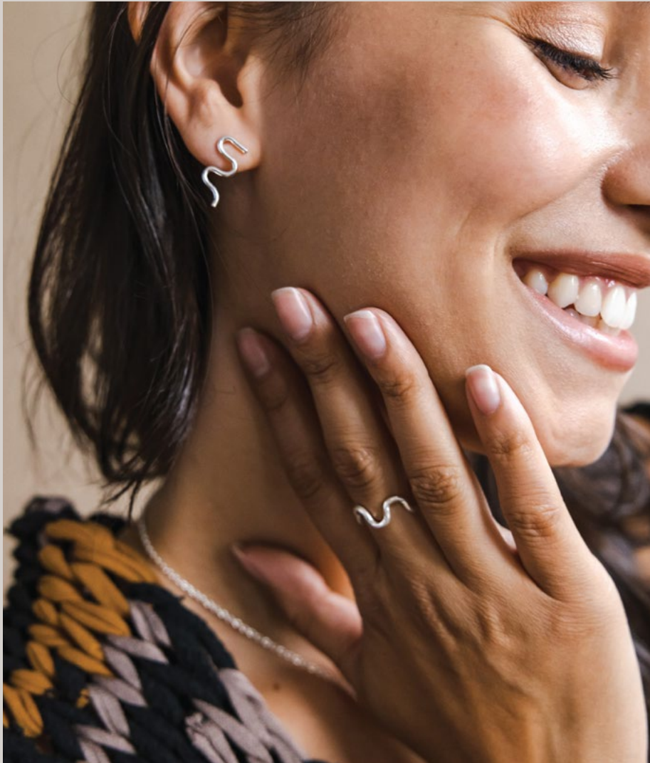
#WSE-ST Wavy Stud Earrings #WVR-ST Wavy Band Ring

GO AHEAD AND GO YOUR OWN WAY. STYLES THAT KEEP IT GROOVY.