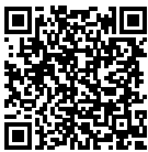
App link to Google Play Store

Software updates are released on a semi-regular basis. We recommend updating to the latest available software version in order to get access to all features.