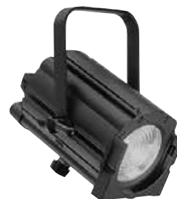
Acclaim Fresnel Selecon Performance Lighting