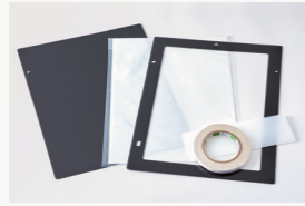
MiScreen a4 Screen Making Start-up kit