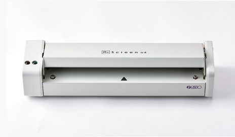
MiScreen a4 Main Unit Included in the package: AC Adapter, Utility Software CD and User's Guide Not included: Power Cord for AC Adapter and USB 2.0 cable

Apply ink on the screen and print with the squeegee.