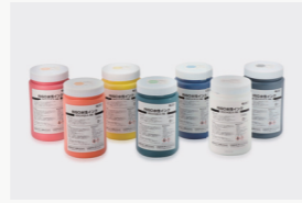
RISOAQUA INK 1,000ml