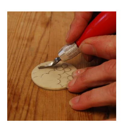
Step 3) Use a fine blade to cut the outline. Use a larger blade to cut away the rest of the stamp you do not wish to print. Always keep your fingers on both hands behind the blade.