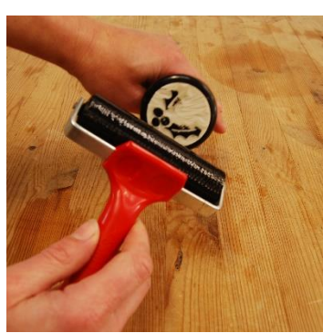
Step 6) Roll the ink onto the stamp.