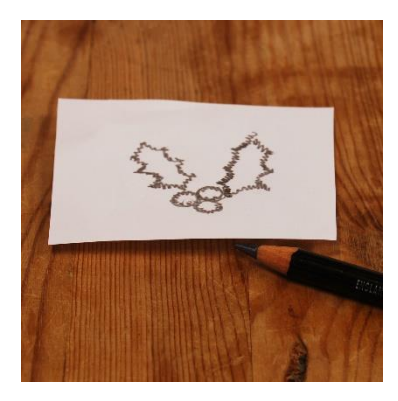
Step 2) Place the image face down onto the disc and then rub a pencil over the lines to transfer the image.