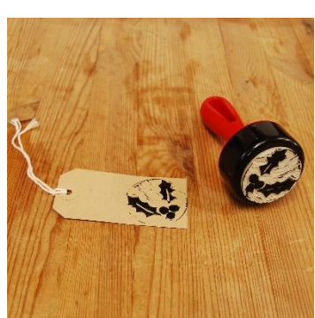
Step 8) The finished print!