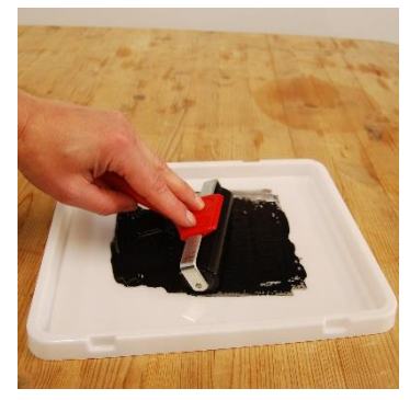
Step 5) Squirt a little block printing ink into a tray and roll it out smoothly using a lino roller. The ink needs to be quite thin and smooth.