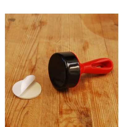
Step 4) Peel off the paper backing and stick the stamp to the bottom of the baren.