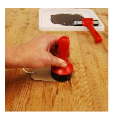
Step 7) Press the stamp firmly onto the gift tag.