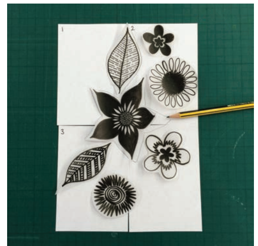
6) Draw round any motifs that go over a cut edge - this will show where the motifs should go when you rearrange the quarters.