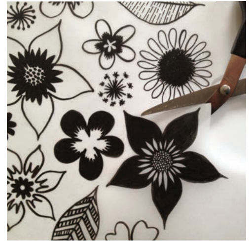
3) Cut out the motifs.