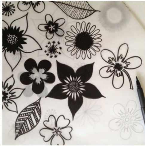
2) Trace your motifs onto tracing paper using a black pen.