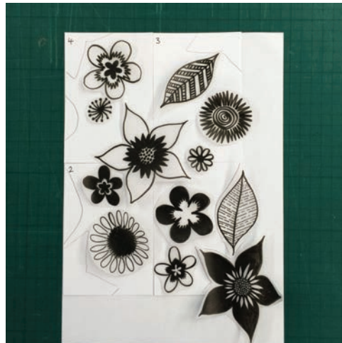
8) Check the design will fit on an A4 sheet (we will be using A4 film and an A4 screen.)