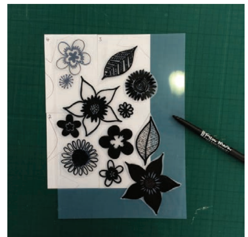
9) Trace your design onto film, using an opaque marker. Keep the edges of the film straight along the top edge of the paper.