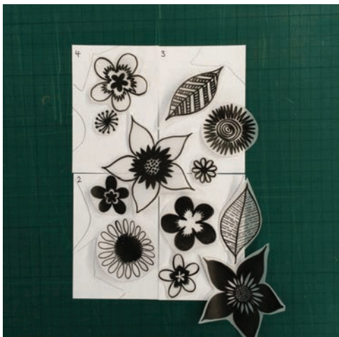
7) Rearrange the pieces into 43 21 and fill in with more motifs.