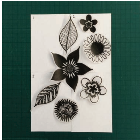
5) Using double sided sticky tape (or rolled up tape) position the motifs onto the paper.