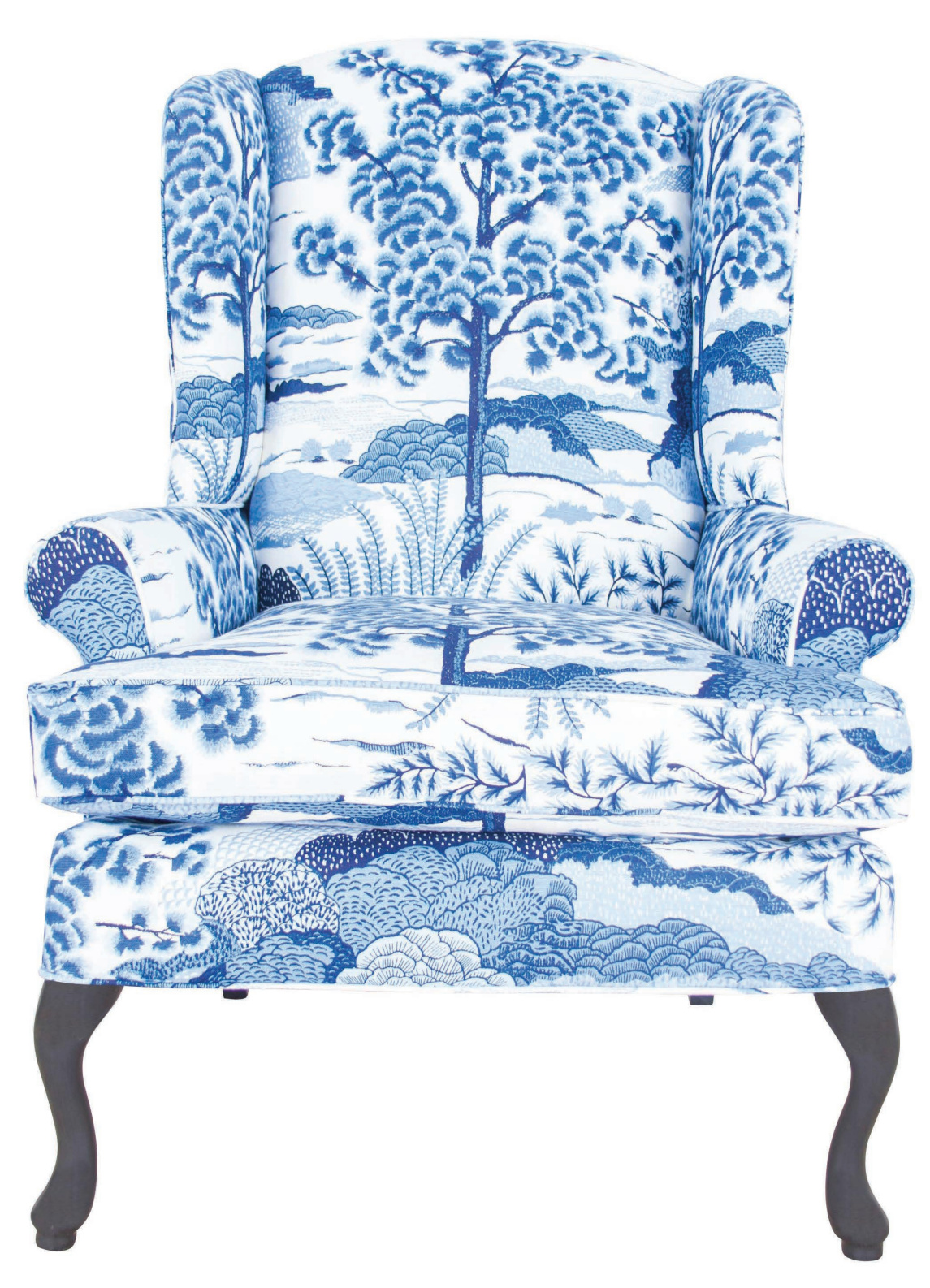
Chelsea Wing Chair in Blue & White Chinoiserie Fabric, linen upholstery, solid hardwood frame, handcrafted in North Carolina, 30 \frac{1}{2} " x 30" x 43 \frac{1}{2} ", $795; at shopsocietysocial.com »