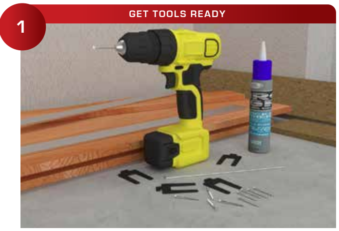
Required Tools: 750 Tapered Shim, Panel Adhesive, Drill, Screws