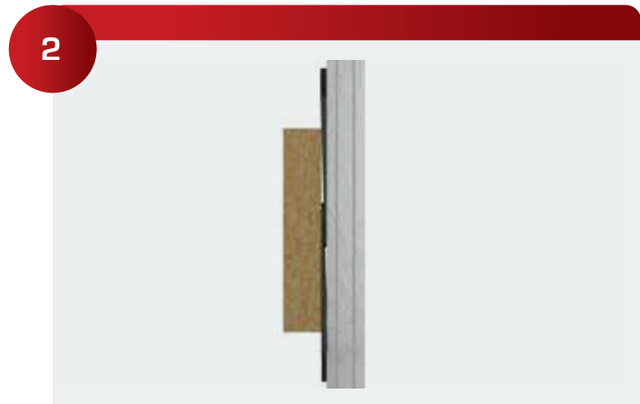
750 Tapered Shims can be used for any item that needs variable spacers. They are especially useful for shimming furring.