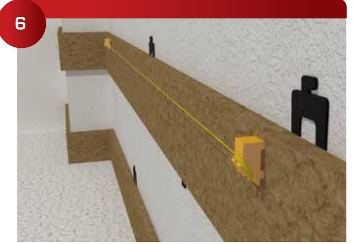
Place a <sup>3</sup>/<sub>4</sub>" thick blocks on the far left and right sides of the furring that are fixed and leveled. Pull a tight string line between the blocks.