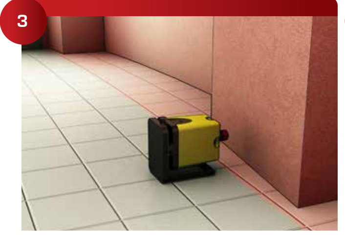
Determine greatest projection (bump out in wall). This will determine the face of your furring and panels. It is important to know exactly where you want your face of furring before you start.