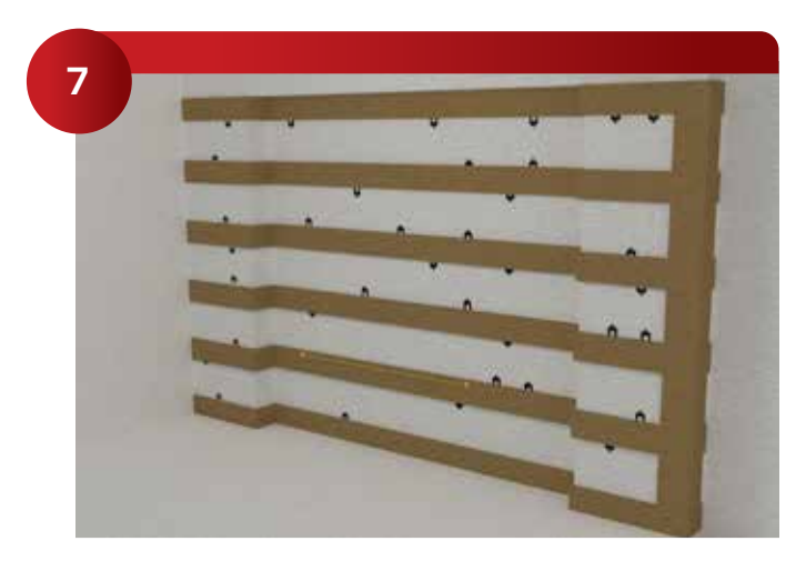
Using a 3rd ¾" thick block, work down the line, one stud at a time to level, shim, glue and screw the furring into permanently into place.