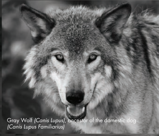
Gray Wolf ( Canis Lupus ), ancestor of the domestic dog ( Canis Lupus Familiaris )

The modern dog evolved from the wolf and the anatomies of modern dogs and their ancestors are almost identical, meaning they need high meat diets. Dogs crave quality meats and that's what we crafted in our biologically appropriate dog foods.