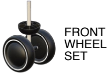
FRONT WHEEL SET