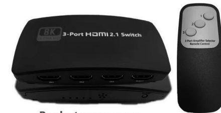
Product appearance The remote control

Accessories: 8K HDMI 2.1 Switch 3 in 1 out x 1, DC 5V Power cable x 1, User Manual X1