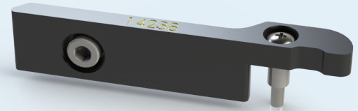
OPTIMIZED FOR VITA 48.2 AND CPCI