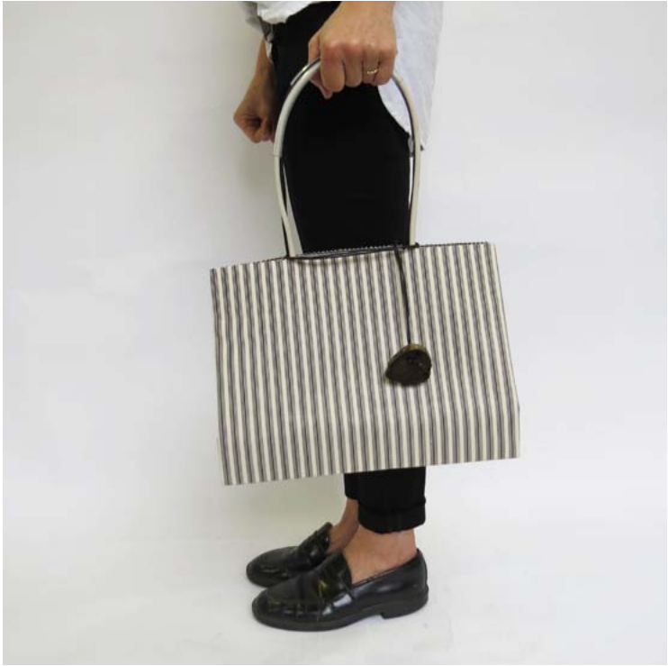
M A D I