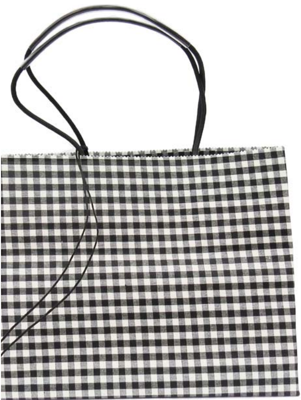
M A R C H E