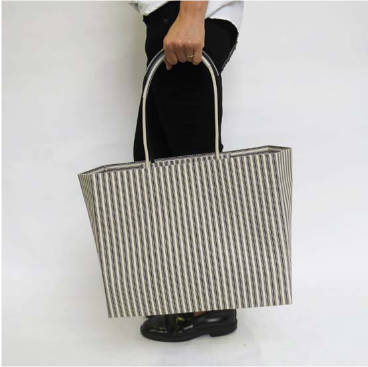
M A R C H