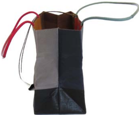
S H A D E 3 navy/gray/black