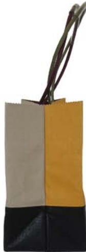
S H A D E 1 mushroom/corn/black