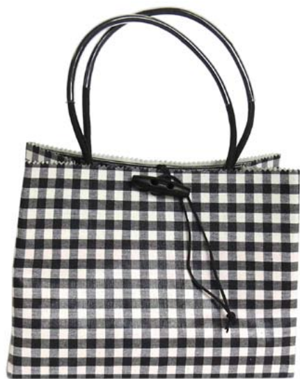
M I N I