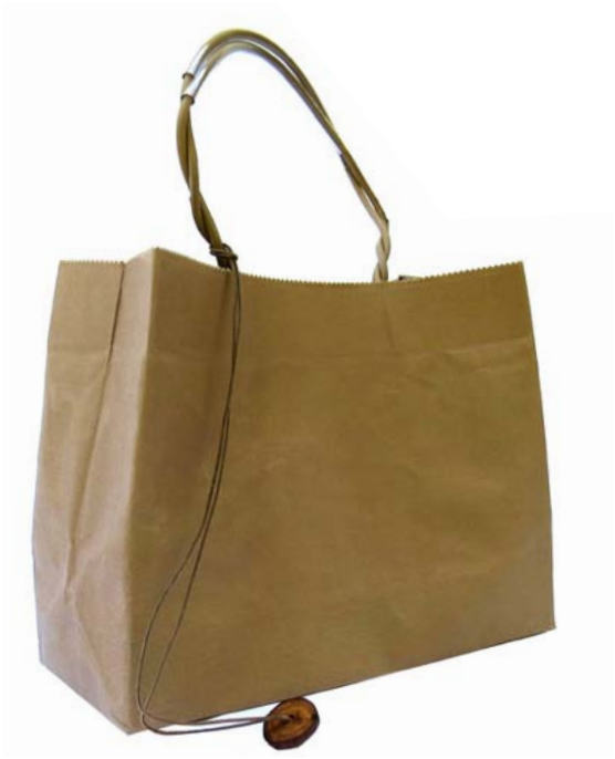
M A R C H É