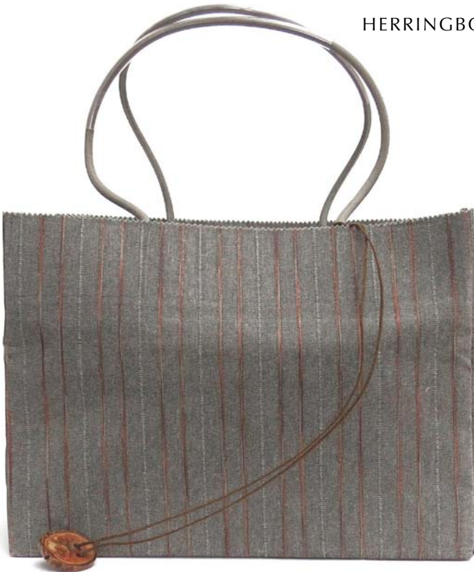
M A D I

4 Sizes: MIDI, MADI, MAXI MARCHE. 3 Colours: WHALE STRIPE, HERRINGBONE