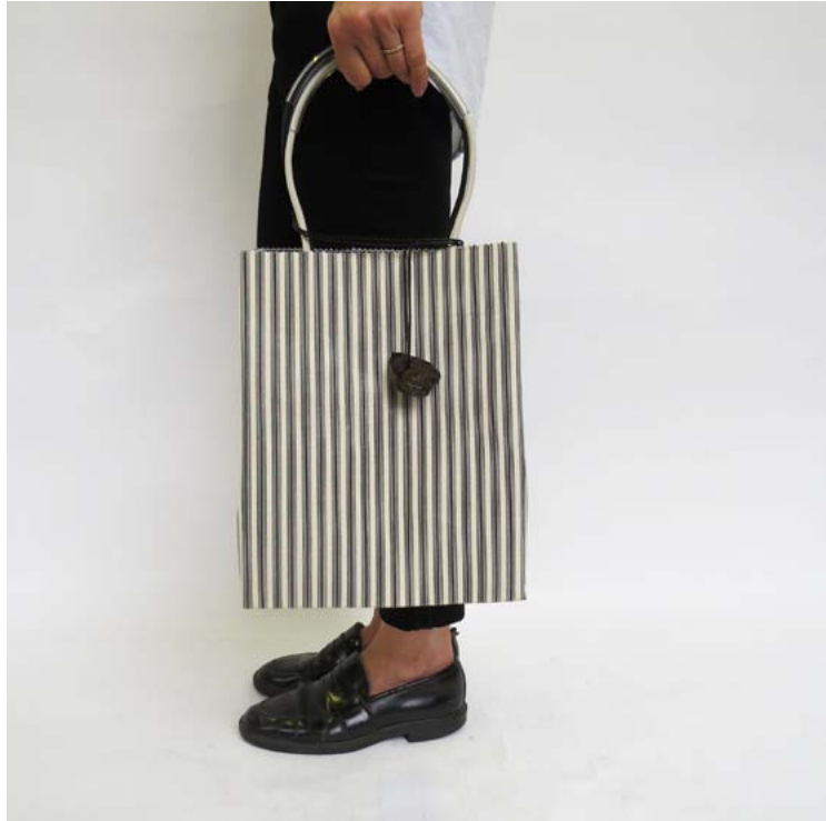
M I D I