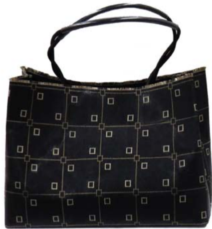
M A D I