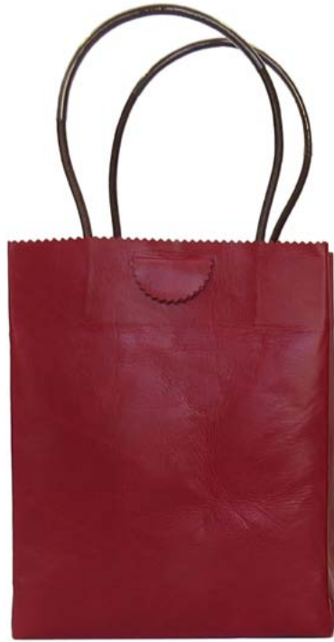
M I D I