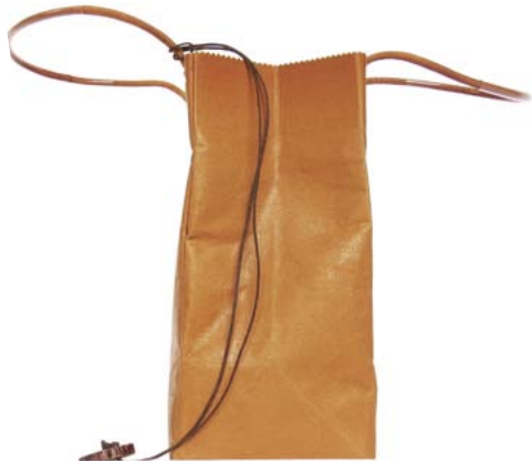
M I D I