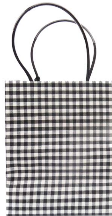
M I D I