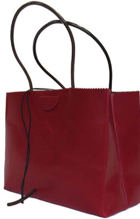
M A D I