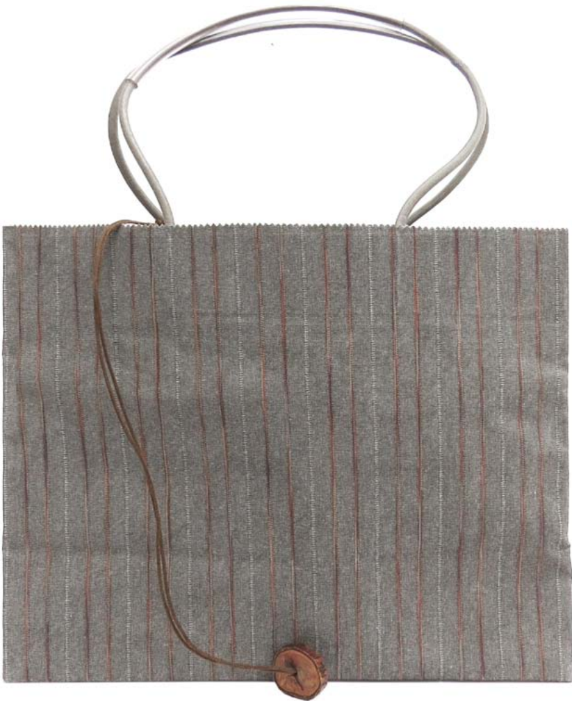
M A R C H E