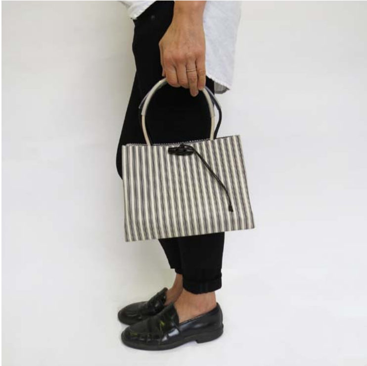
M I N I