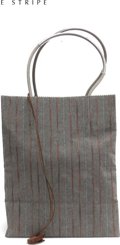
M I D I