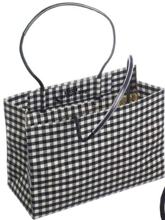
M A D I