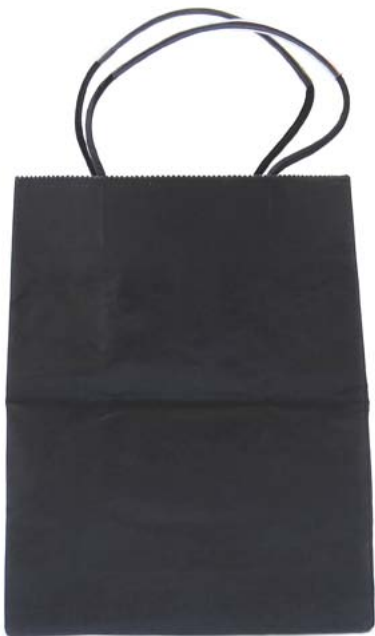
M A X I