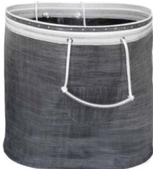
GREAT GRANDE 12"X24"X23h"