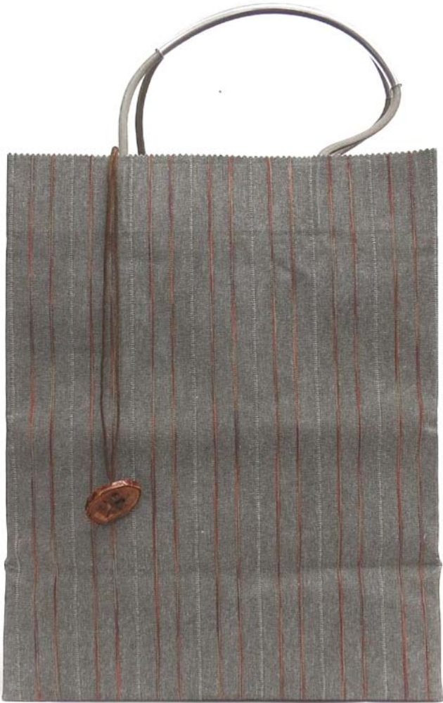
M A X I