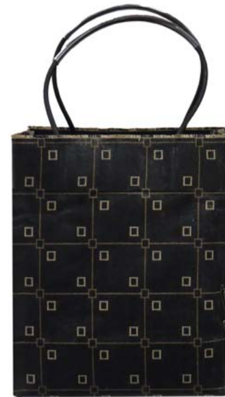
M I D I