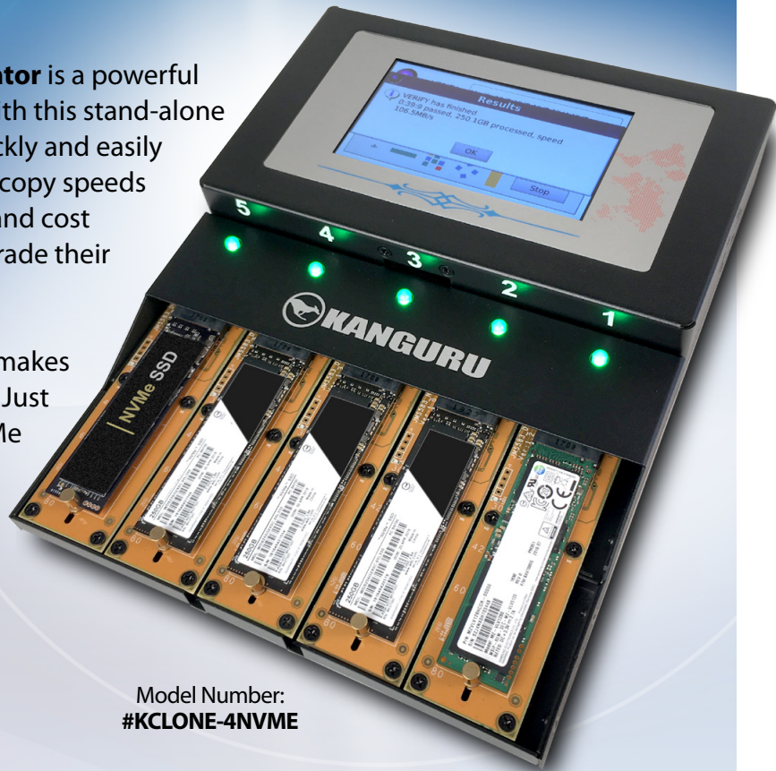
Model Number: #KCLONE-4NVME

A full-color, 4.3" TFT touchscreen user interface makes this the easiest-to-use Kanguru duplicator ever! Just attach your master NVMe drive and up to 4 NVMe solid state drives and you will be duplicating with just a few taps of the screen. The KanguruClone 4 M.2 NVMe SSD Duplicator has advanced features for the IT professional, yet the controls are simple enough that even a novice can begin using it within minutes of taking it out of the box.