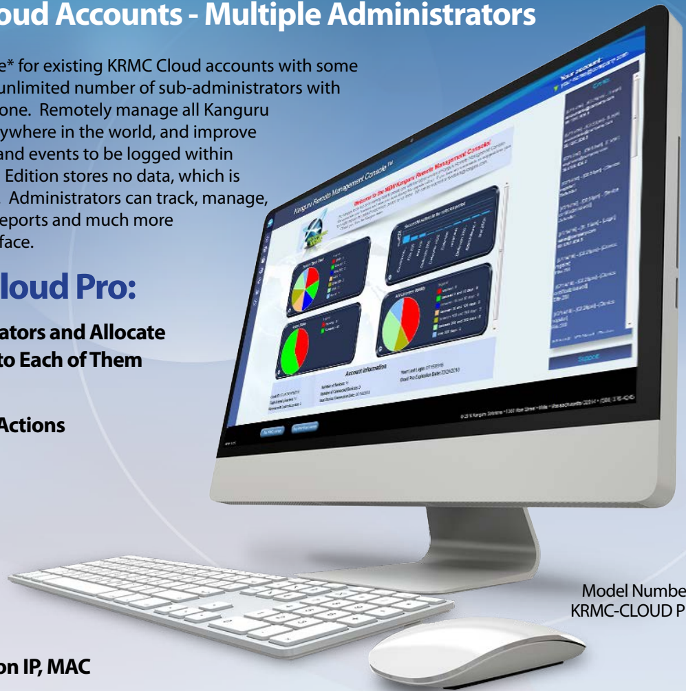
Model Number: KRMC-CLOUD PRO