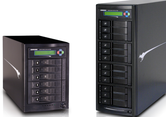
Part #: KCLONE-5HD-TWR