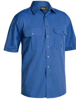
BS1031 METRO SHIRT SS