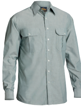
BS6030 OXFORD SHIRT LS