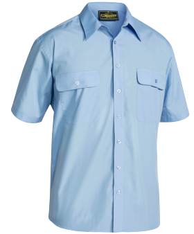
BS1526 PERMANENT SHIRT SS