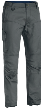
BPC6475 RIPSTOP ENGINEERED CARGO WORK PANT