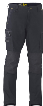
BPC6330 FLEX & MOVE™ STRETCH UTILITY ZIP CARGO PANT