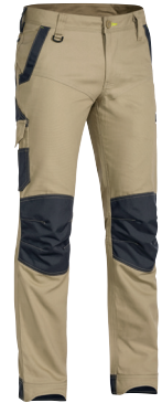
BPC6130 FLEX & MOVE™ STRETCH CARGO PANT