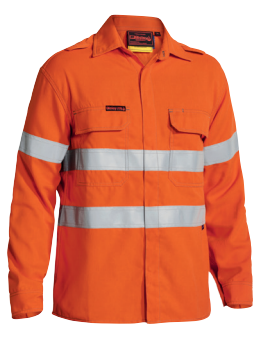
BS8197T TENCATE TECASAFE® PLUS 580 TAPED HI VIS FR NON VENTED SHIRT LS