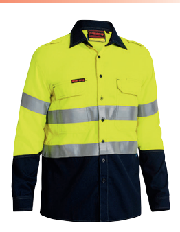
BS8098T TENCATE TECASAFE® PLUS 580 TAPED 2T HI VIS LW FR VENTED SHIRT LS