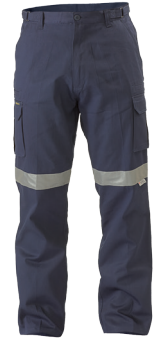
BPC6007T TAPED DRILL PANT