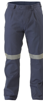
BP6007T TAPED DRILL PANT