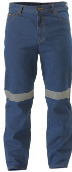
BP6050T 3M TAPED REGULAR JEAN