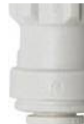
Faucet quick connection for 1/4" tubing

To disconnect, ensure that the system is depressurized, push the collet square against the fitting. With the collet held in this position the tube can be removed.