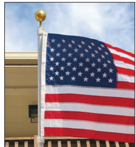
Part No. TRK-8400