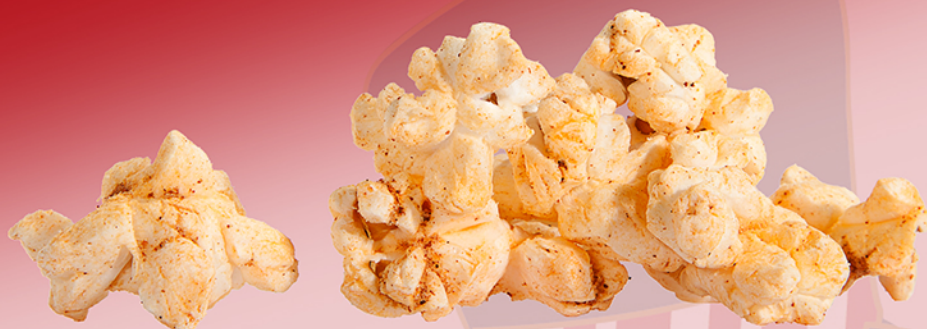
Spicy Dill Pickle Popcorn