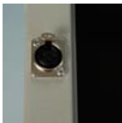
1 x Microphone Socket

A full range of accessories are available for the Tutor Lectern including: Gooseneck Microphones, Phantom Power Supply, Customised Logo Printing, Lighting, Shelving, Castors. Prices on request.