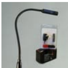
Battery or Powered LED Light