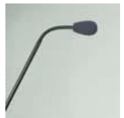
Gooseneck Lectern Microphone