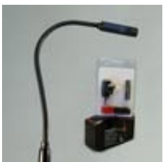
Battery or Powered LED Light