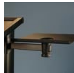
Adjustable Laptop Shelf