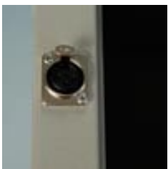
1 x Microphone Socket

A full range of accessories are available for the Lecturer Lectern including: Gooseneck Microphones, Phantom Power Supply, Customised Logo Printing, Lighting, Shelving, Castors. Prices on request.