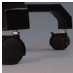
Locking Castor Wheels