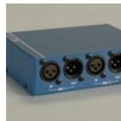
Phantom Power Supply