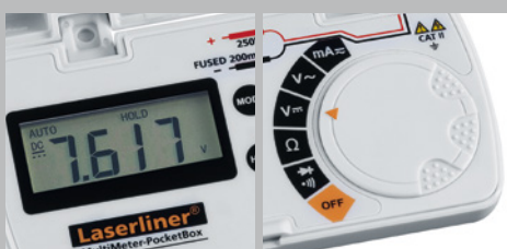
Large LC display