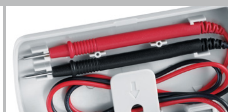
Test prod holder