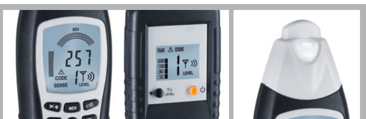
Clearly arranged, illuminated LC display