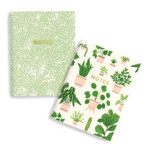
SAGE SAFARI & HOUSEPLANTS PN012