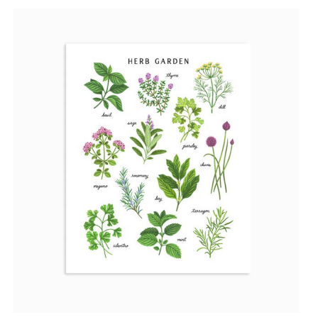
HERB GARDEN LIGHT 8 X 10 | PRT09-S 11 X 14 | PRT09-L