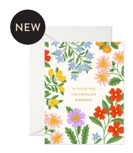
LOVELIEST BIRTHDAY HB023 | HB023-B