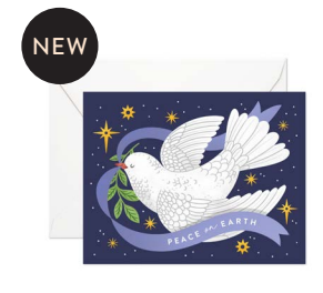
PEACE ON EARTH HD022 | HD022-B gold foil