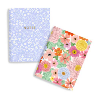
BLUE MINI FLORAL & SUMMER FLORAL