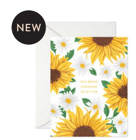
SUNSHINE SUNFLOWERS LV020 | LV020-B