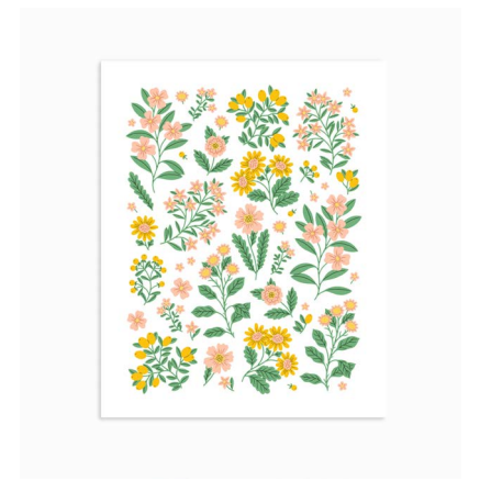
GOLDEN GARDEN 8 X 10 | PRT04-S 11 X 14 | PRT04-L