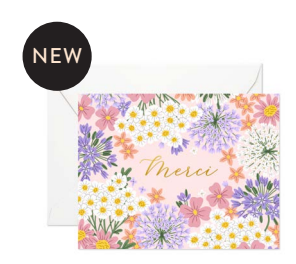
MAISIE MERCI TY019 | TY019-B gold foil