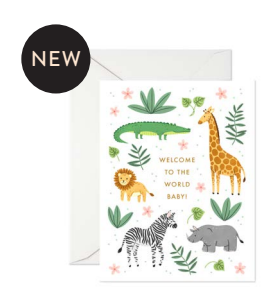
SAFARI BABY BB009 | BB009-B