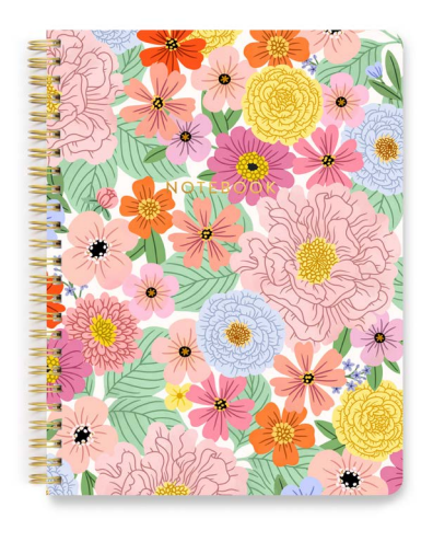
SUMMER FLORAL SN006