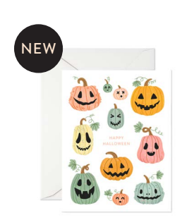
HAPPY HALLOWEEN HW001 | HW001-B