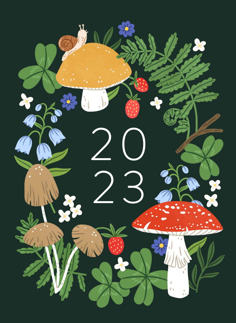
ILLUSTRATION & PAPER GOODS