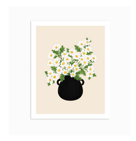
FEVERFEW 8 X 10 | PRT03-S 11 X 14 | PRT03-L

Minimum 4 per design | Unit Price: $10 (8x10) and $15 (11x14) | Packaged in clear sleeve with backing board