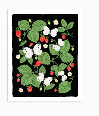
STRAWBERRIES AND BUTTERFLIES 8 X 10 | PRT08-S 11 X 14 | PRT08-L