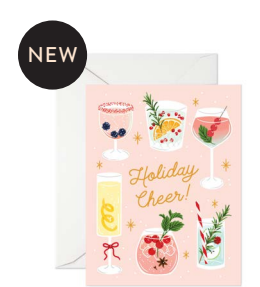
HOLIDAY CHEER HD018 | HD018-B