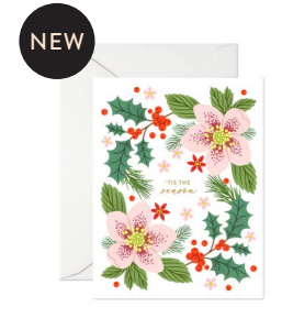
'TIS THE SEASON HD023 | HD023-B