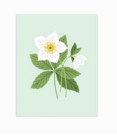
HELLEBORES 8 X 10 | PRT06-S 11 X 14 | PRT06-L