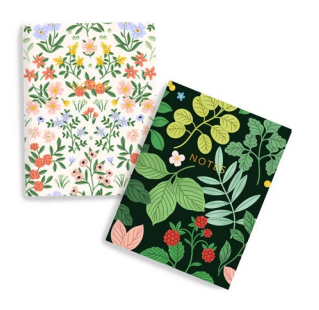
MEADOWS & BOTANICA PN009