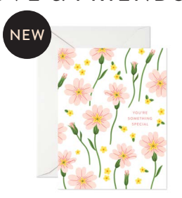
YOU'RE SOMETHING SPECIAL LV022 | LV022-B