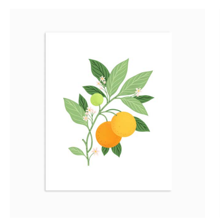
ORANGE BRANCH 8 X 10 | PRT07-S 11 X 14 | PRT07-L