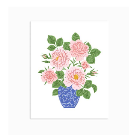
GARDEN BLOOMS VASE 8 X 10 | PRT02-S 11 X 14 | PRT02-L