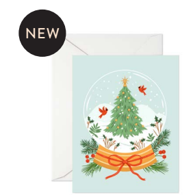
SNOW GLOBE HD021 | HD021-B