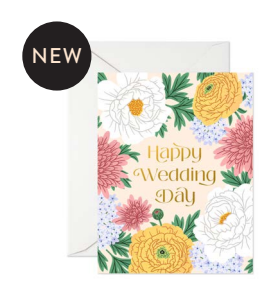
HAPPY WEDDING DAY CG016 | CG016-B gold foil