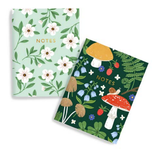
MUSHROOMS & MINTY FLORAL PN013

Minimum 4 per set | Unit Price: $7 | Packaged in a clear sleeve with sticker