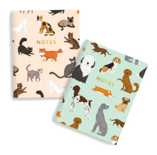
CATS & DOGS PN010