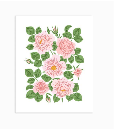
GARDEN BLOOMS 8 X 10 | PRT01-S 11 X 14 | PRT01-L