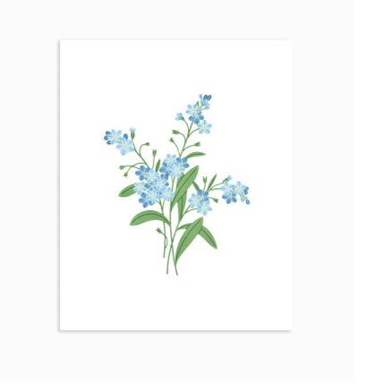
FORGET-ME-NOTS 8 X 10 | PRT05-S 11 X 14 | PRT05-L