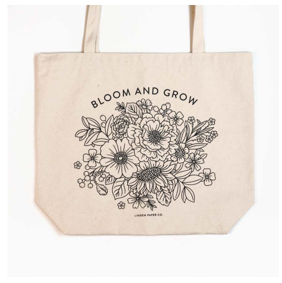
BLOOM AND GROW TB001

Minimum 4 per design | Unit Price: $15 | Packaged with a string and hang tag