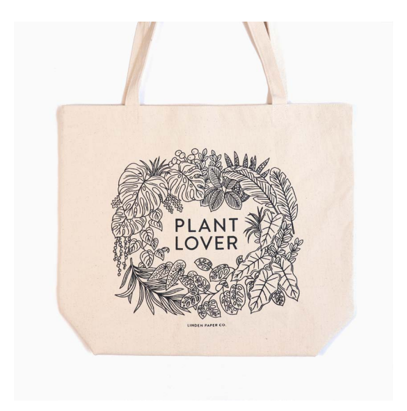
BLOOM AND GROW TB002