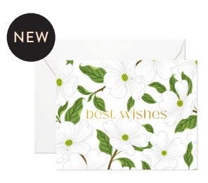
BEST WISHES DOGWOODS CG017 | CG017-B gold foil