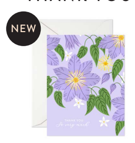
THANK YOU SO VERY MUCH TY020 | TY020-B