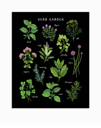
HERB GARDEN DARK 8 X 10 | PRT10-S 11 X 14 | PRT10-L