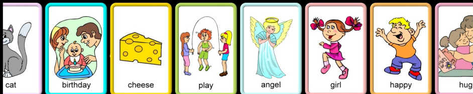
cat birthday cheese play angel girl happy hug