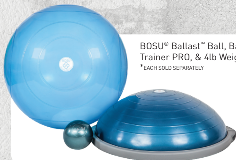
BOSU® Ballast™ Ball, Balance Trainer PRO, & 4lb Weighted Ball. *EACH SOLD SEPARATELY