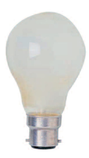
fig 2.1 General Service Bulb Bayonet Cap. (BC) 25W - 40W - 60W - 100W

AS USED IN UK, AUSTRALASIA, INDIAN SUB-CONTINENT AND PARTS OF THE MIDDLE EAST.