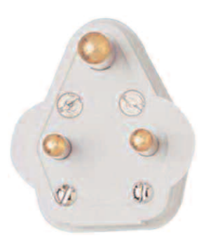
fig 3.2 5 Amp Lighting Circuit Plug