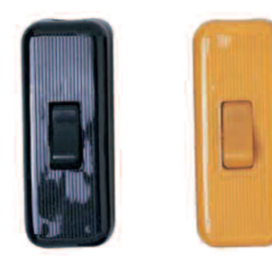
fig 5.1 fig 5.2 In-line, Cord or "Torpedo" switches. Gold or Black