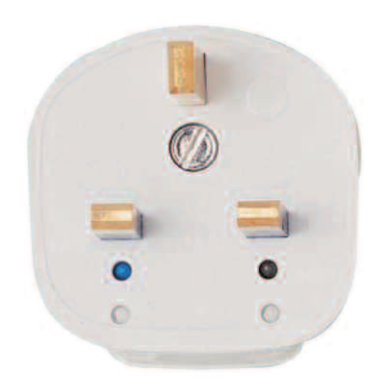
fig 3.1 13 Amp Square Pin Plug (for lamps, use a 3 amp fuse)