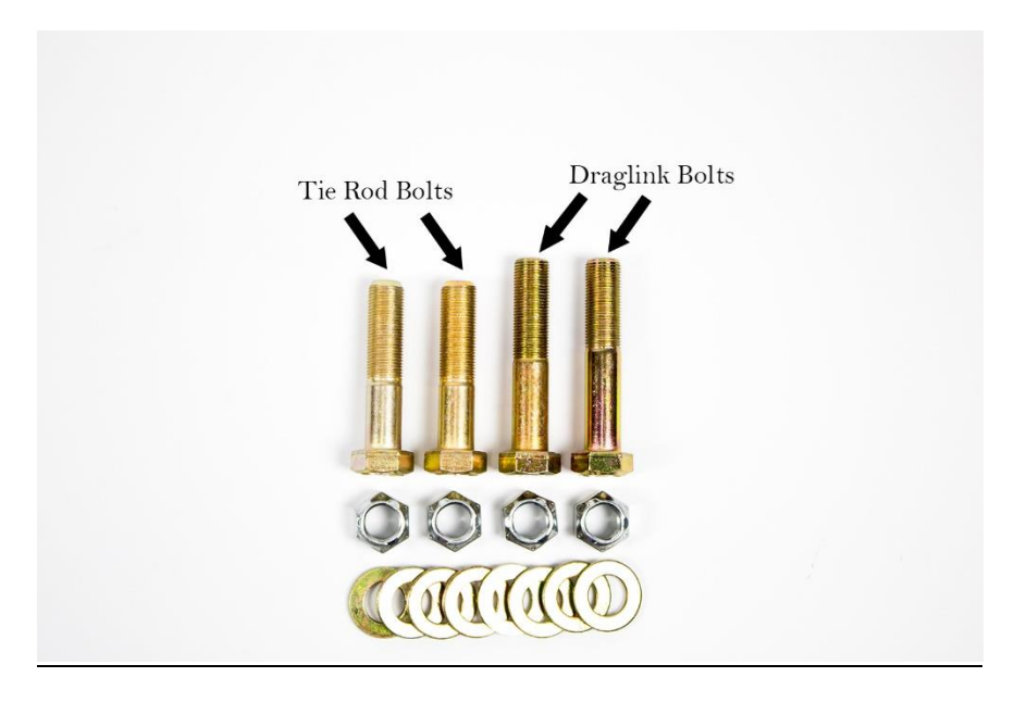
Step 3: This kit can be installed in two separate configurations; Standard or "Draglink flipped".