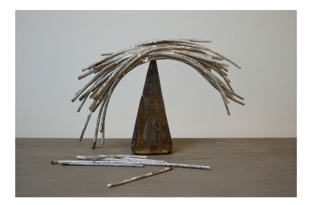
Harvest 稲刈り- inekari #2 hand-build, stoneware, glaze 26 x 35 x 10cm $420