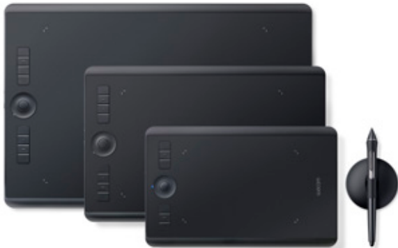
Featured products: Wacom Intuos Pro (Large, Medium & Small) Featured artist: Mouni Feddag