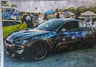
A total of 40 cars and about 200 people showed up to Naro Mak's Chicken and Cars show on April 25.

“For most, some of these cars could only be seen in the movies,” Mak said. “At Chicken and Cars, you can see them up close and talk to their owners and mechanics.”