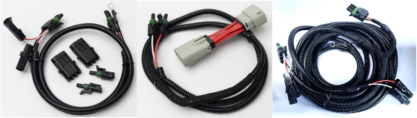
FULL Harness to front/Switches

To install the tail light adapter, simply remove the 2 bolts inside the tailgate. Then wiggle the tail light out of the snaps.