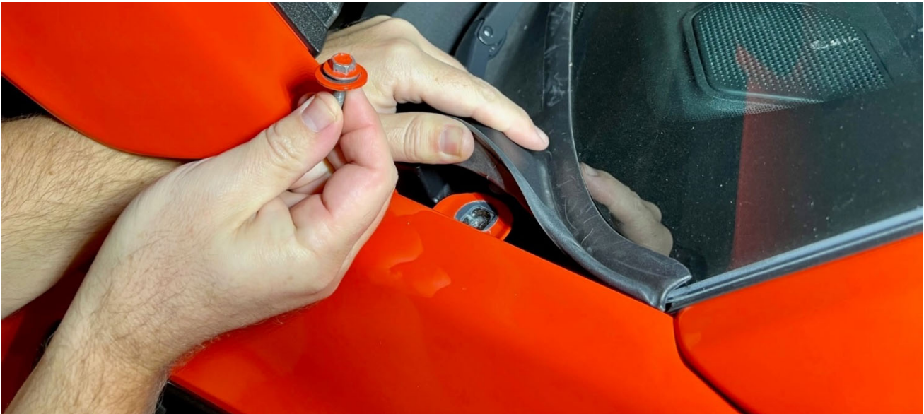
Fig 2: (Pic turned sideways)