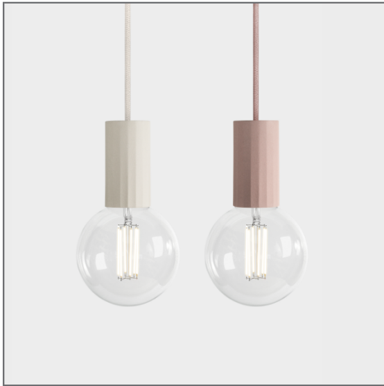
Image shows Natural & Blush