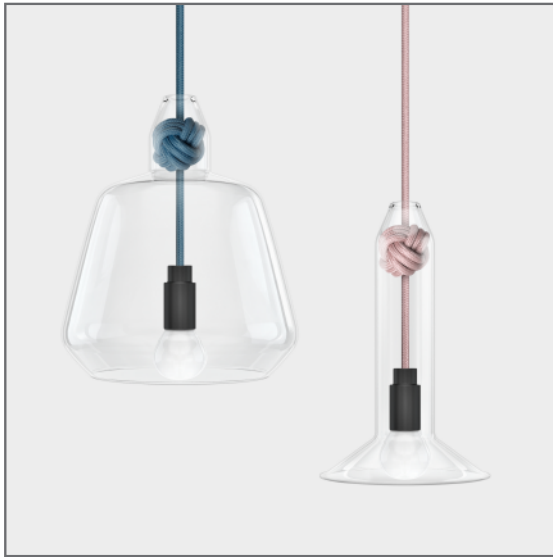
Image shows Large Knot Lamp with a Mid Blue cable & Small Knot Lamp with a Dusky Pink cable