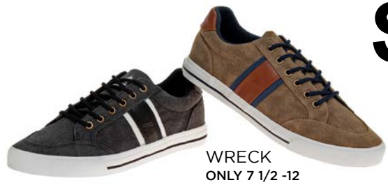
WRECK ONLY 7 1/2 -12 AND 8 1/2 -13

MA: 7-10 12's MB: 7 1/2-12 12's ME: 8 1/2-13 12's