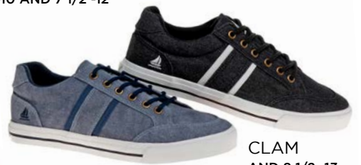
CLAM AND 8 1/2 -13