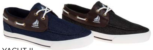
YACHT II NAVY BROWN ONLY SIZE 7-10 AND 7 1/2 -12