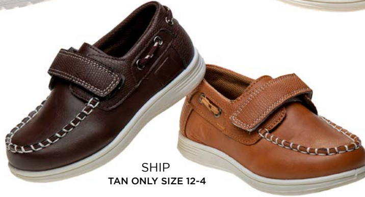
SHIP TAN ONLY SIZE 12-4