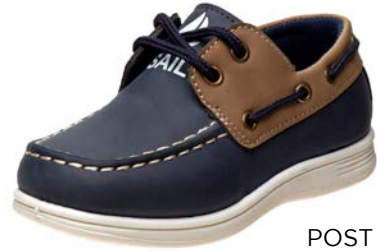
POST ONLY SIZE 12-4