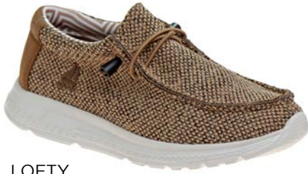
LOFTY 11-5 18's