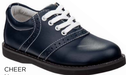
CHEER Navy CHILD: 10-4 ADULT: 6-11