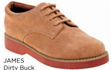
JAMES Dirty Buck CHILD: 10-3 3 1/2-7 ADULT: 7 1/2-13