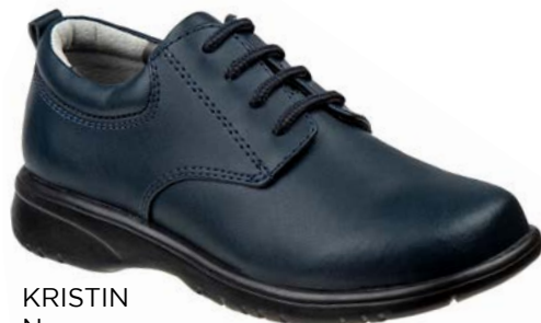
KRISTIN Navy CHILD: 10-4