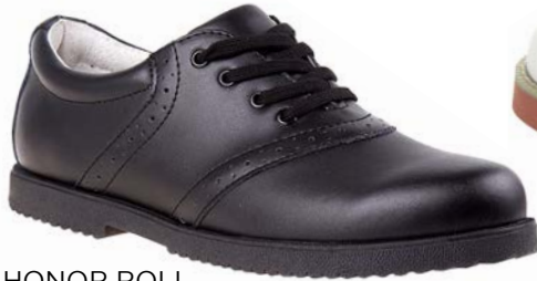
HONOR ROLL Black CHILD: 10-4 ADULT: 6-11