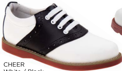
CHEER White / Black CHILD: 10-4