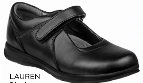
LAUREN Black CHILD: 10-4 5-11