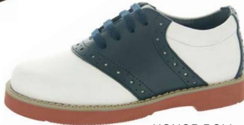
HONOR ROLL White / Navy ADULT: 6-11