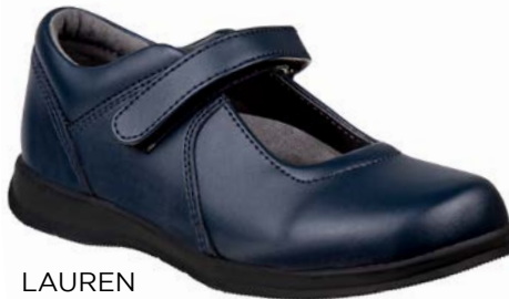
LAUREN Navy CHILD: 10-4 ADULT: 5-11