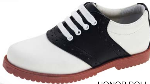
HONOR ROLL White / Black ADULT: 6-11