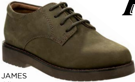
JAMES Olive CHILD: 10-3

LEATHER STITCHED OUTSOLE OPEN STOCK MEDIUM & WIDE