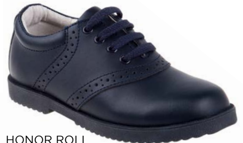
HONOR ROLL Navy ADULT: 6-11