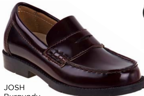
JOSH Burgundy ADULT: 6 1/2-13 CHILD: 10-3