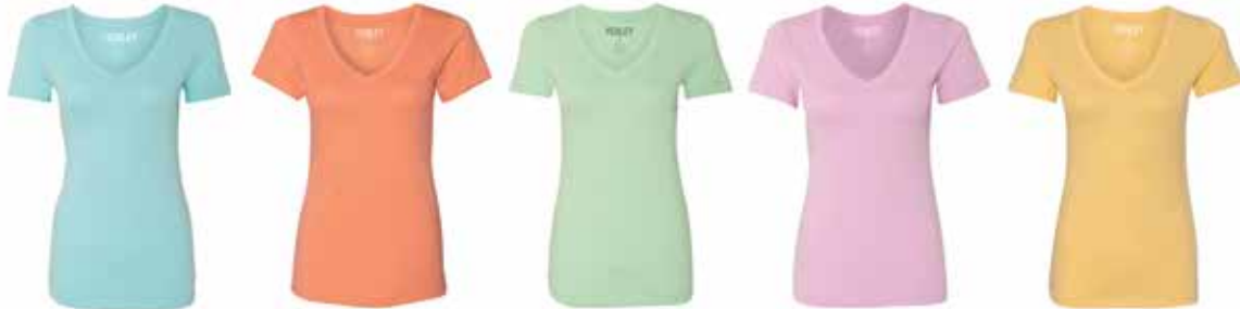
CANCUN LIGHT ORANGE MINT LILAC BANANA CREAM