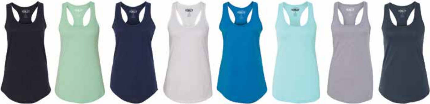
BLACK MINT MIDNIGHT NAVY WHITE TURQUOISE CUNCUN HEATHER GREY INDIGO