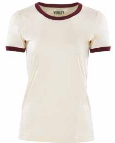
NATURAL / MAROON