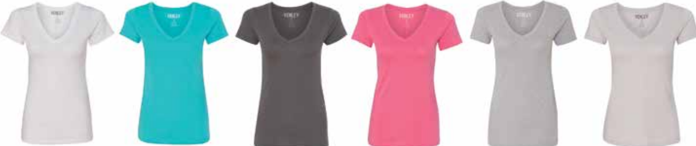
WHITE TAHITI DARK GREY HOT PINK HEATHER GREY SILVER