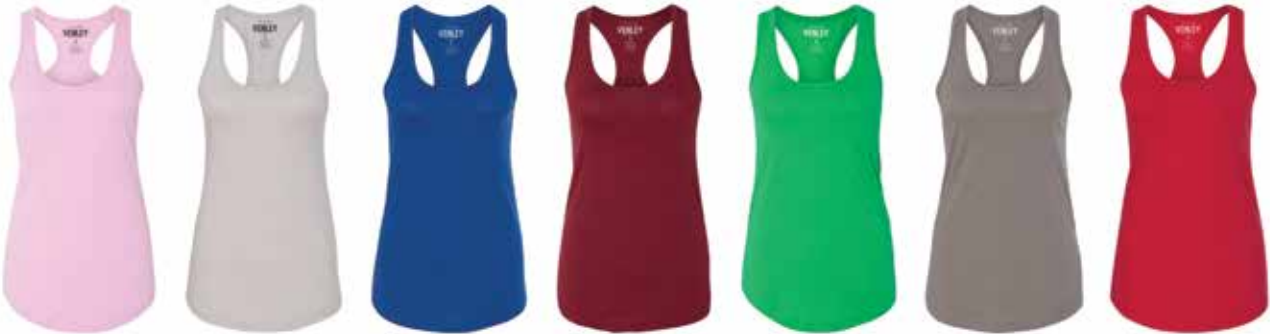
LILAC SILVER ROYAL SCARLET KELLY GREEN WARM GREY RED