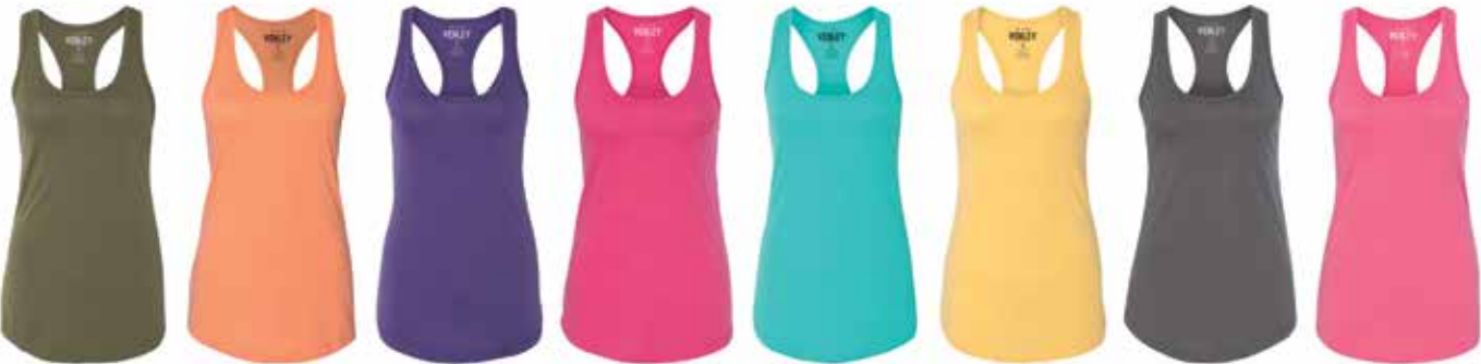
MILITARY GREEN LIGHT ORANGE PURPLE RUSH RASPBERRY TAHITI BLUE BANANA CREAM DARK GREY HOT PINK