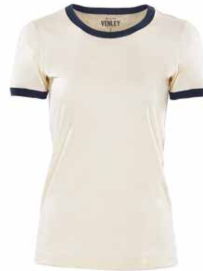
NATURAL / MIDNIGHT NAVY