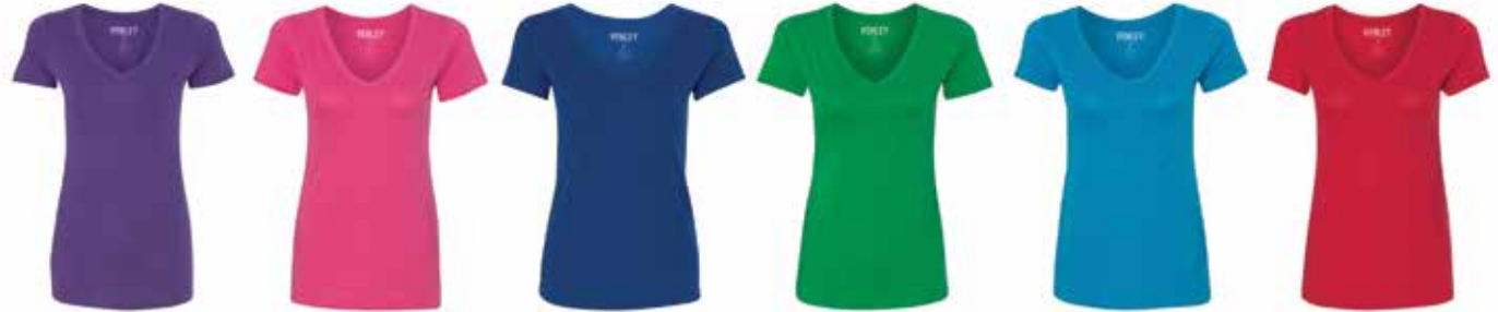
PURPLE RUSH RASPBERRY ROYAL BLUE KELLY GREEN TURQUOISE RED