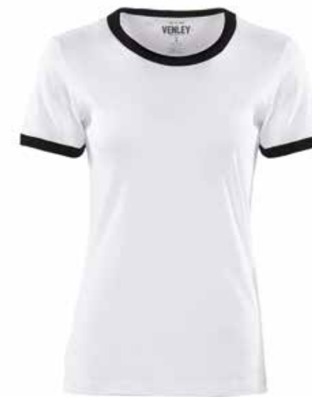
WHITE / BLACK