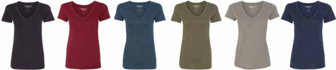
BLACK SCARLET INDIGO MILITARY GREEN WARM GREY MIDNIGHT NAVY