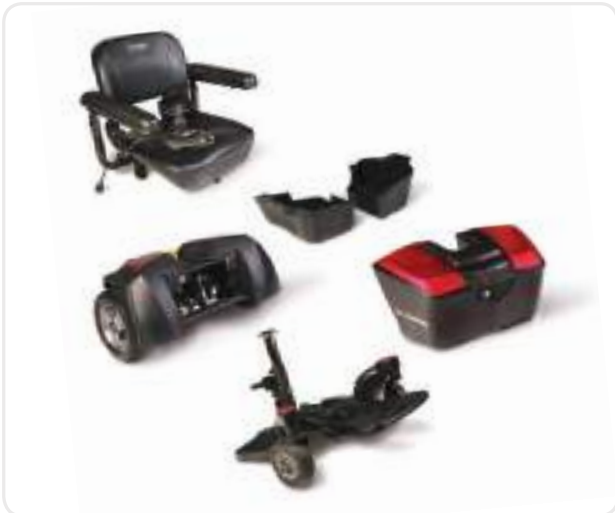
One-hand "Feather Touch" disassembly

The all-new Go Chair® is re-engineered from the ground up, offering a bold style available in an array of contemporary colours. Enhanced performance and comfort, along with feather-touch disassembly, allows you to enjoy lightweight travel and independence on the go. With an increased weight capacity of 136 kgs (300 lbs.) and a sleek, bold look, the Go Chair® makes travel easy.