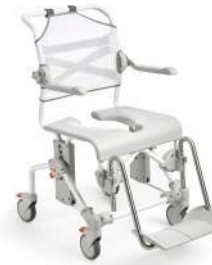
Etac Swift Mobil-2

Easy to adjust to different fixed seat heights, without using tools.