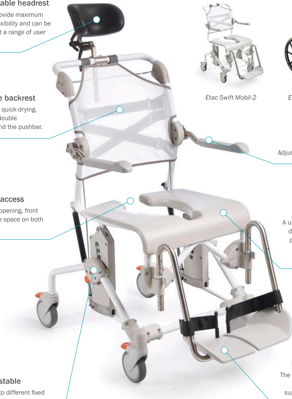
Etac Swift Mobil Tilt-2

The gently curved footplates provide instep and arch support, ensuring comfort, stability and relaxation.