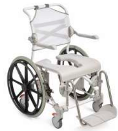
Etac Swift Mobil 24"-2