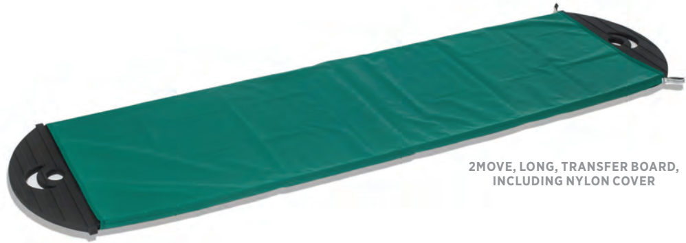
2MOVE, LONG, TRANSFER BOARD, INCLUDING NYLON COVER