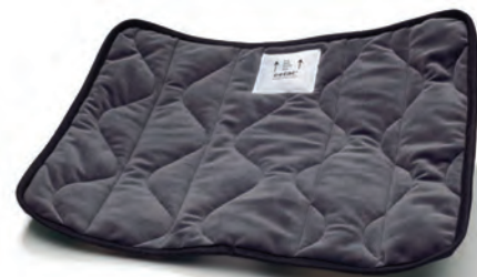
ONEWAYGLIDE PAD VELOUR