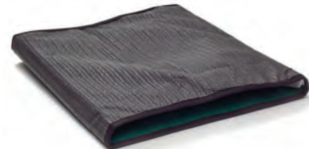
ONEWAYGLIDE NON-SLIP TUBULAR CUSHION