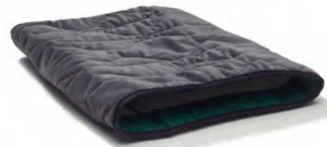
ONEWAYGLIDE VELOUR TUBULAR CUSHION