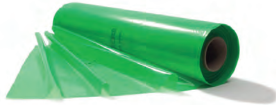
DISPOSABLE COVER IN ROLL