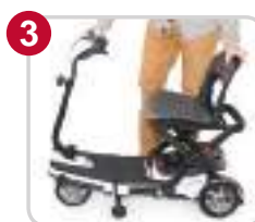
Unfold Seat; Lock in Place