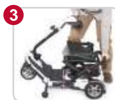
Fold and Lock Tiller