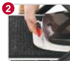
Pull Up Lever to Fold