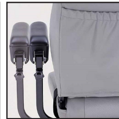
Width adjustable armrest