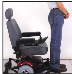
Excellent stability on footplate