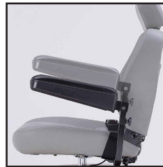
Height adjustable armrest