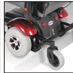
True six wheel design