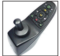
Dynamic Shark Controller