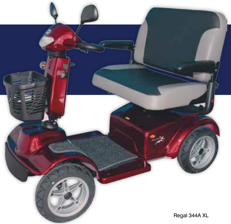
Regal 344A XL