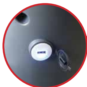
Handy USB fitting