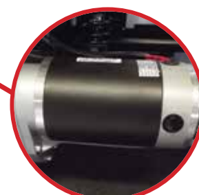
Powerful 2 Pole Motor