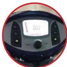
New Anti Glare LCD Screen