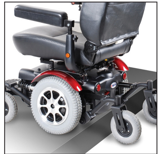
Built to navigate everyday obstacles